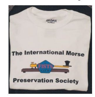
SKU# NA015T Cost is $11 each including postage Sizes: M-3XL

Gildan<sup>®</sup> brand, 50/50 preshrunk, white color, no pocket. Color FISTS logo on front only.