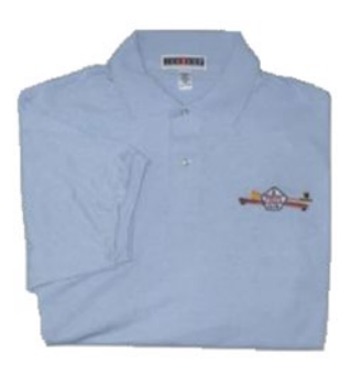
SKU# NA001P Cost: $15.50 each, including postage Sizes: M, L, XL, 2XL, 3XL

Jerzees<sup>®</sup> brand, 50% cotton/50% polyester. FISTS logo embroidered over left breast, no pocket.