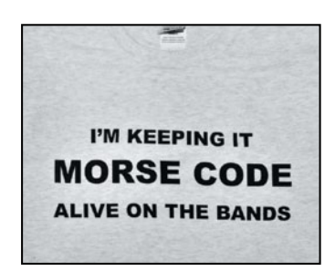
SKU# NA018T Cost is $9 each, including postage Sizes: M–3XL

Light gray T-shirt by Gildan<sup>®</sup>. 100% heavyweight cotton, no pocket. Back has same image as My Fingers Do My Talking shirt.